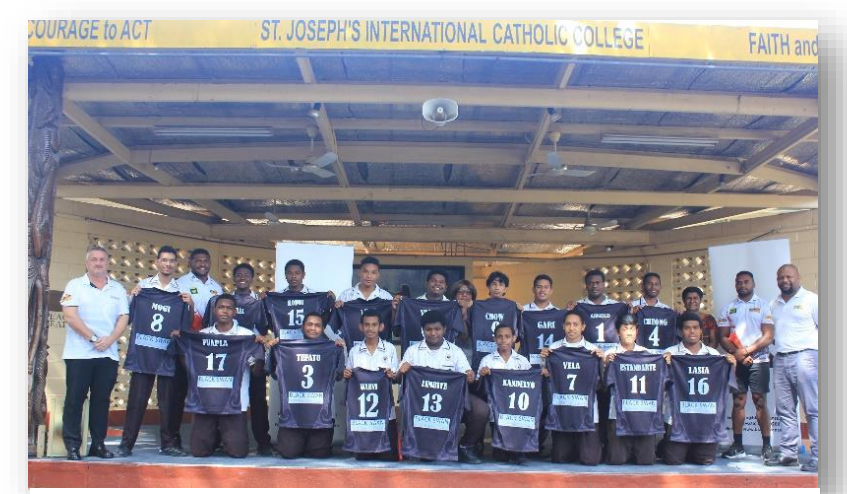
BSI Management and SP Hunters presenting the rugby jerseys to Kings Rugby Union Team.

Black Swan International was honored to be part of such an event, where young future generations of the country are being mentally and physically active and we recognize that Rugby Union is not just a sport but more than that. It is a force of inspiration to the young generation of PNG.